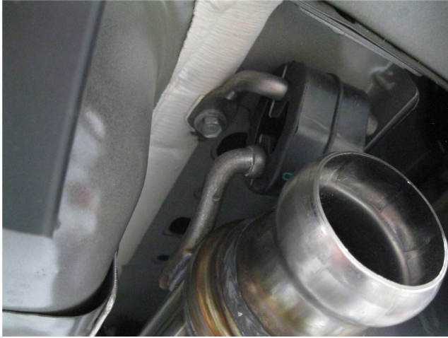
TAIL PIPE DETAIL

Step 6. Insert all hanger assemblies into the rubber insulators for for both passengers and drivers side muffler assemblies. Now using the supplied 3.00" clamps loosely secure them to the Tru-X assembly.