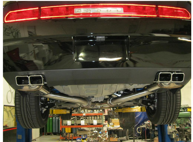
FINISHED INSTALLATION, REAR VIEW

Step 8. Attach each tip to the muffler outlet ball flare using the supplied ball clamp and bolt. Loosely secure using a 12mm socket.